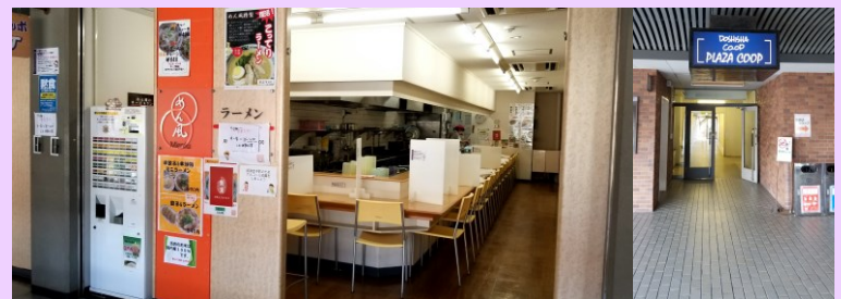
Doshisha also has convenience stores and a ramen shop!