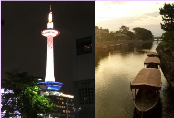
You can visit sightseeing spots such as Kyoto Tower (left) and Uji River (right). Many more await you!