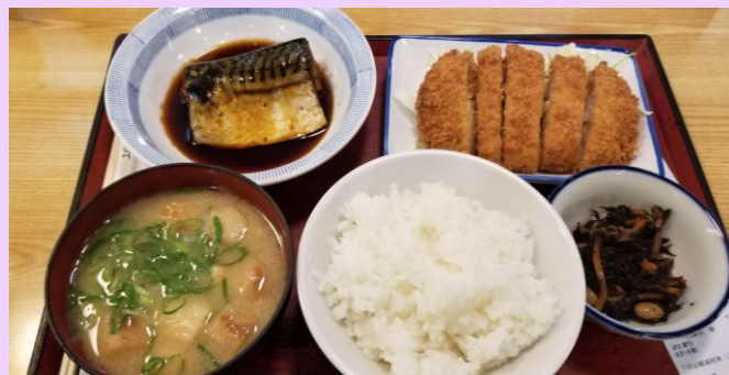
A delicious lunch from the school cafeteria

A Yes, some food in the cafeteria can be eaten by people with religious restrictions. You can ask the cafeteria staff for the ingredients. When you order lunch from the cafeteria, information such as calories are also written on the receipt!