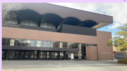
Davis Memorial Auditorium

A Yes! In the past year, students have made a virtual campus tour called Panoramic View Promotion (PVP) for international students to see. This promotion video consists of various laboratories in the campus. It's also shown in a 3D fashion, where viewers get a feel of the surroundings!