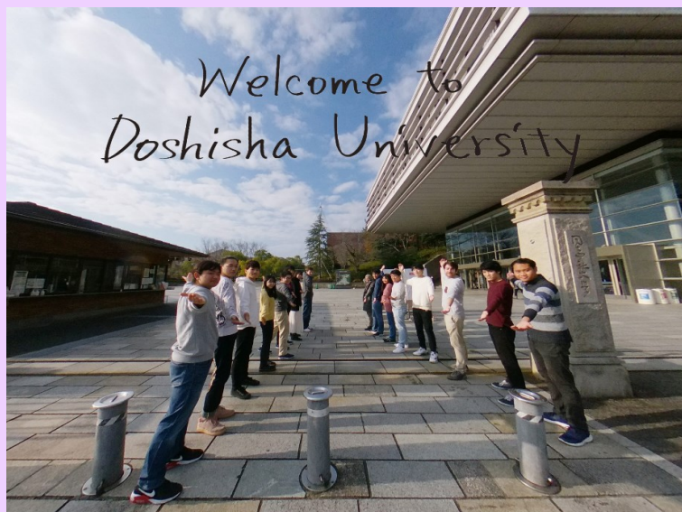
Here is a cover photo of the PVP student project at Doshisha

You can also effectively learn Japanese through courses offered at Doshisha!