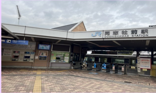
Doshishamae literally means 'in front of Doshisha'!