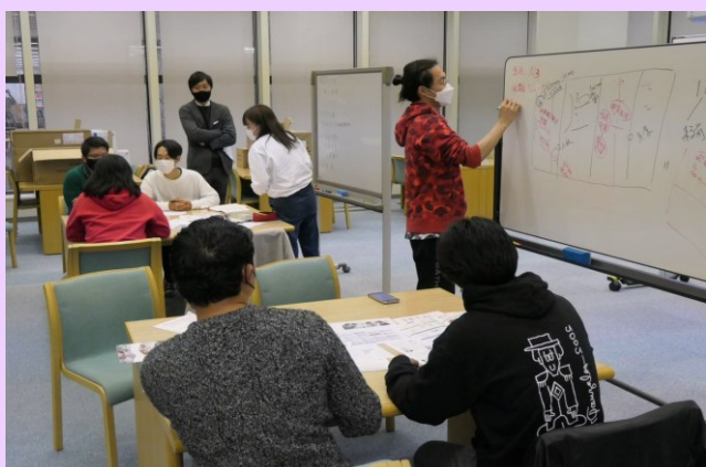
We collaborate with Japanese students and fellow international students through Co-Learning program at Doshisha!

Doshisha University also has peer support programs that aim to help international students adjust to both campus and daily life with the support of a peer. Please visit the OIS website for the latest news.