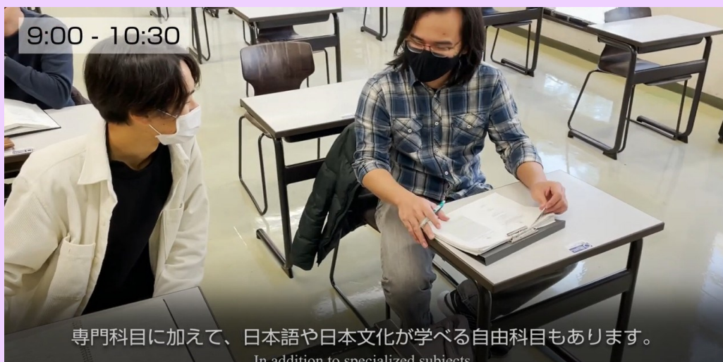
A screenshot of the student-made video about life in Doshisha

Take a look at our short video introducing the daily life of a Doshisha international student.